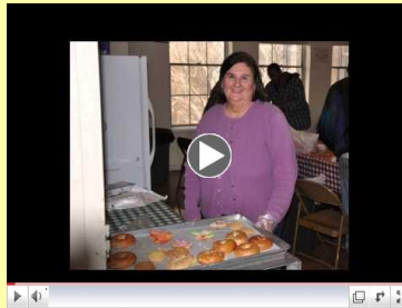
Little Rock Stewpot

To See a short video about the Stewpot, click on the photo below.