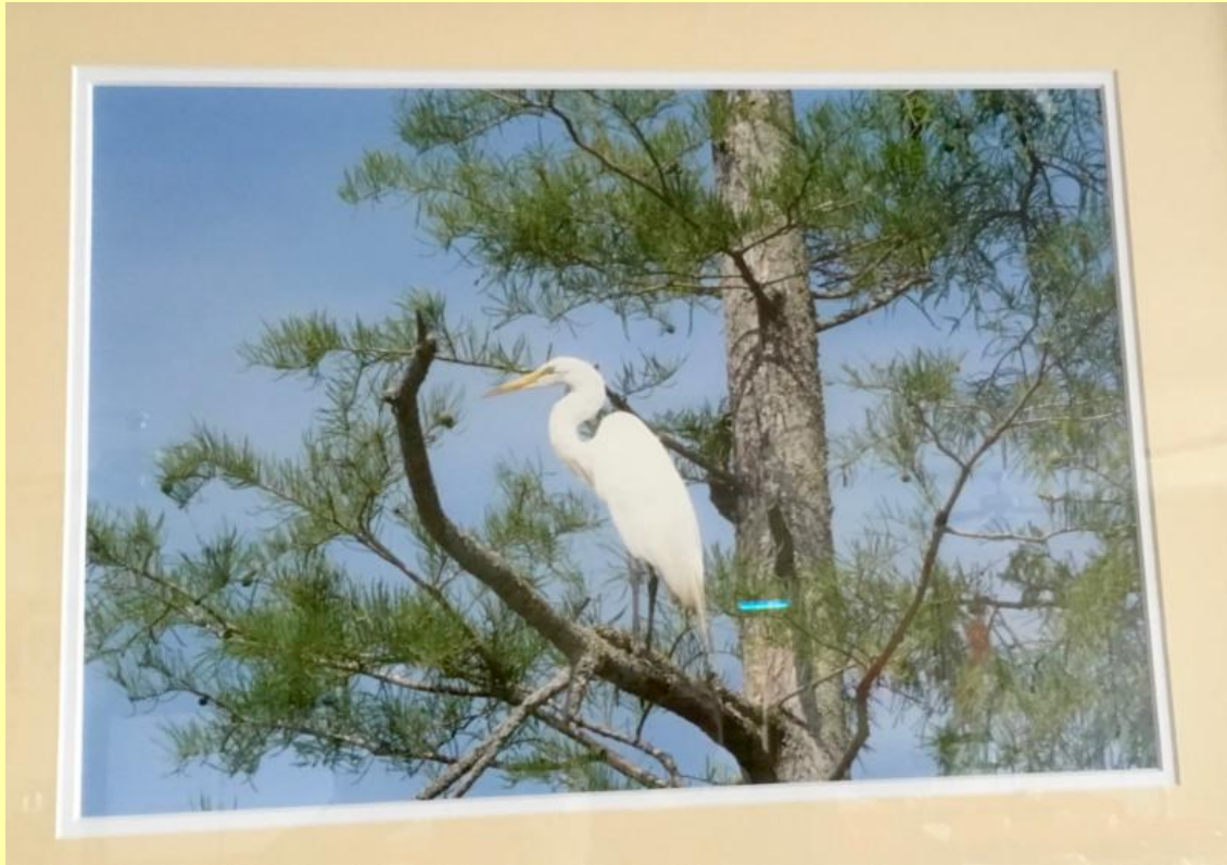
White Egret - Little Maumelle River