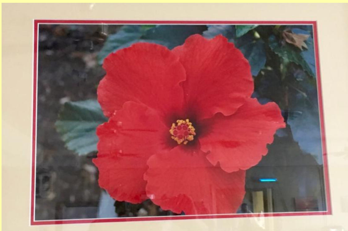
Red Tropical Hibiscus