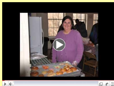
Little Rock Stewpot

To See a short video about the Stewpot, click on the photo below.