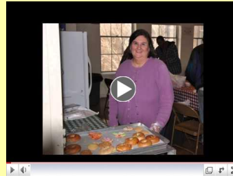
Little Rock Stewpot

To See a short video about the Stewpot, click on the photo below.