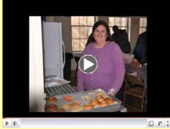
Little Rock Stewpot